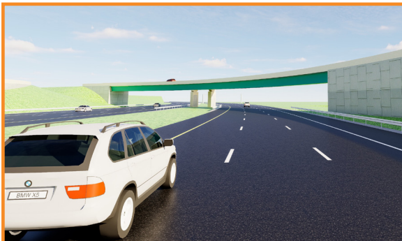
Closeup of SR 429 at the proposed ramp bridge