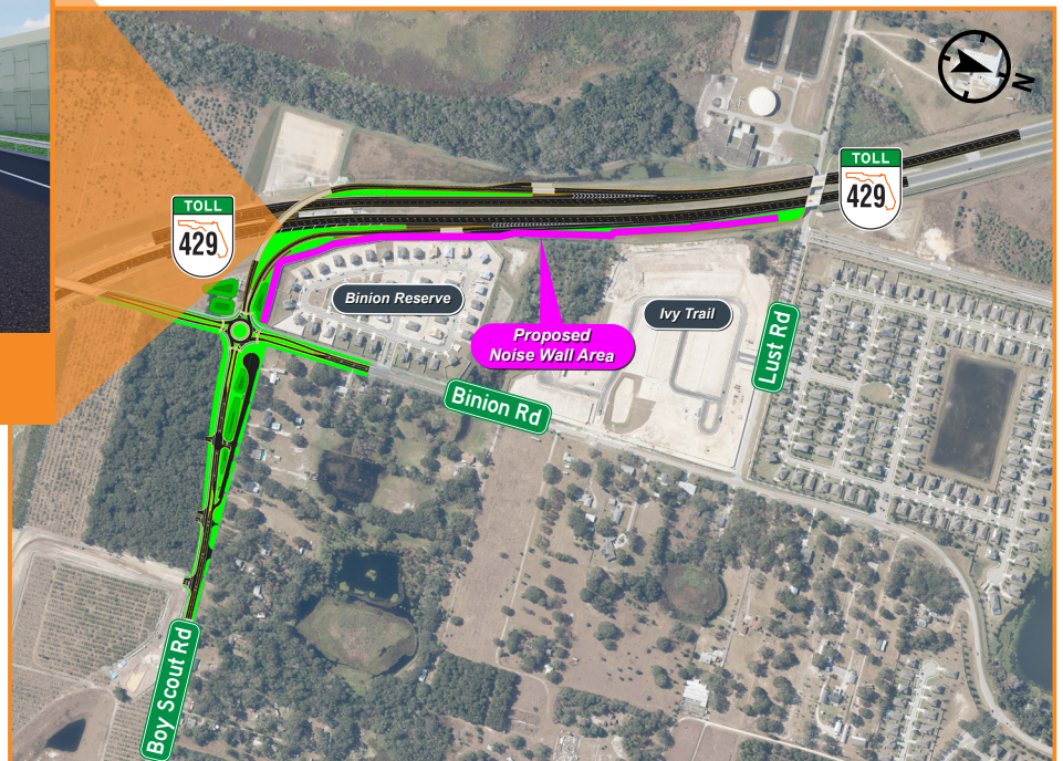
SR 429 at Binion Road Proposed Design